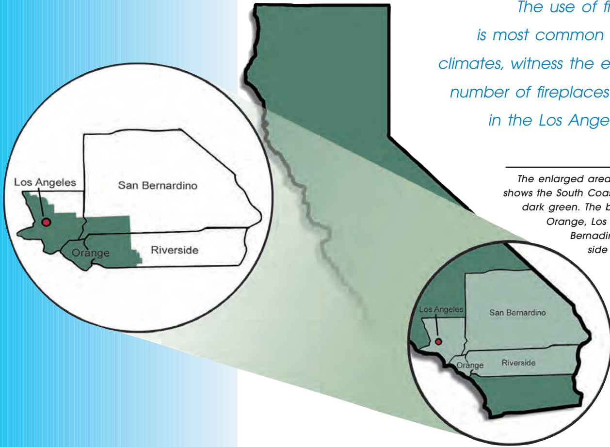
The enlarged area on the map shows the South Coast Air Basin in dark green. The boundaries of Orange, Los Angeles, San Bernardino and Riverside Counties are also shown.

The use of fireplaces is most common in milder climates, witness the enormous number of fireplaces located in the Los Angeles area.